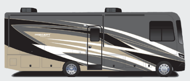
Wren Full-Body Paint