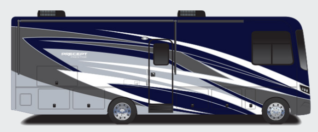
Oriole Full-Body Paint