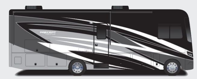
Chickadee Full-Body Paint