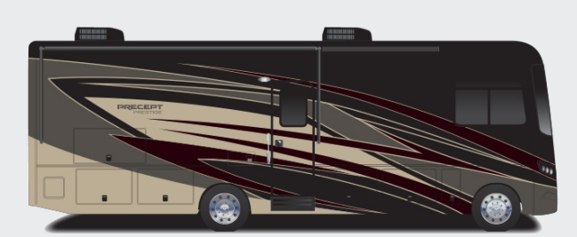
Warbler Full-Body Paint