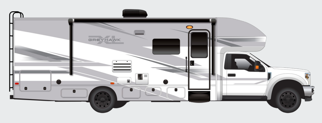
Partial Paint Package