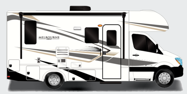
Standard Graphics Package