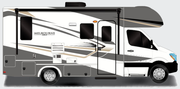
Optional Partial Paint